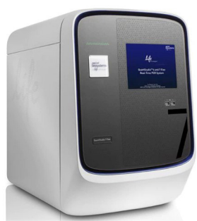
QuantStudio™ 7 Plex

Eurofins Bioanalytical Services helps our clients make the optimal choice in this “fit-for-purpose” approach, leveraging a wide variety of different platforms including: