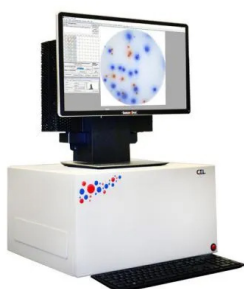
ImmunoSpot® S6 Entry M2